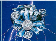
6.2 Liter V8 Diesel Engine