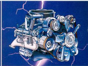
5.0 Liter V8 Gasoline Engine