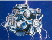
4.3 Liter Vortec V6 Gasoline Engine